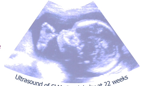
Ultrasound of SLM client's baby at 22 weeks

Please pray for us and contact us if you would like to help.