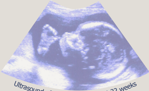
Ultrasound of SLM client's baby at 22 weeks

On Friday, January 22, 2010, the Roe vs. Wade anniversary marks 37 years of legalized abortion and over 49 million babies aborted in the United States. These statistics are disturbing, and yet we as Christians stand prayerfully strong on behalf of the unborn. We are grateful for the opportunity to share a life-affirming and redeeming message to a growing number of women and men who come to us for help.